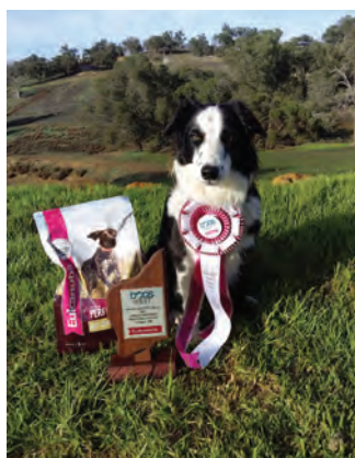
Masters Agility 500 AG CH Wicked Back In Black Kriszty Kelly