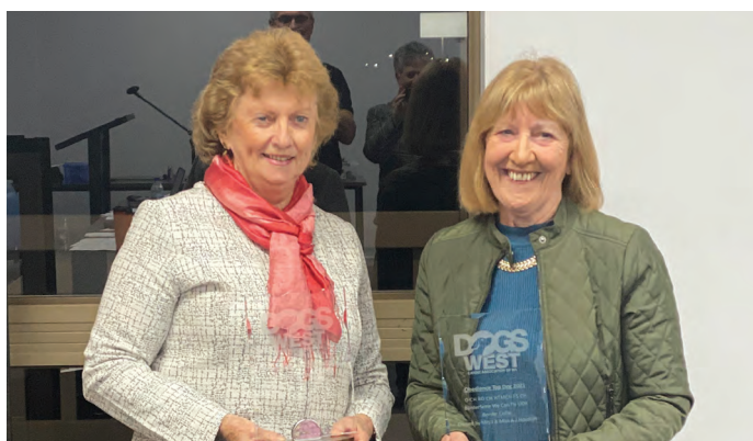
Dances With Dogs Top Dog 2021 & Obedience Top Dog 2021 - O CH RO CH HTMCH FS CH Borderfame We Can Fly UDX, Border Collie