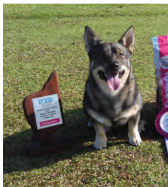
Novice Jumping 300 CH Ubique Don't Walk Away TK.S JD FS.N HTM.N Jill Houston