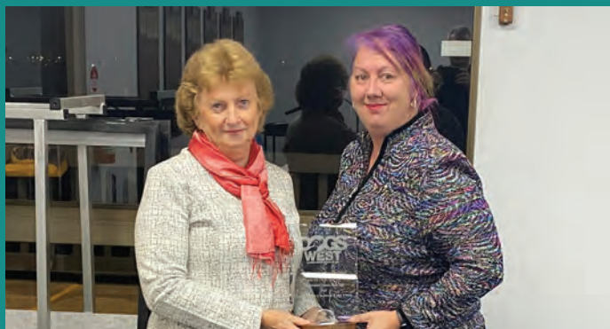
Conformation Top Dog 2021 - Am Gr Ch SI Sup Ch Cordmaker Mister Blue Sky, Puli