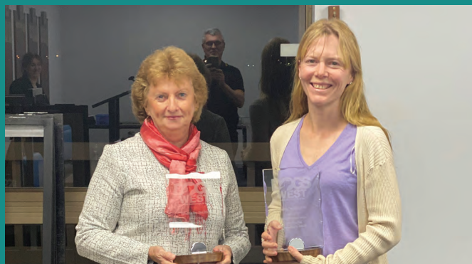
Agility Top Dog 2021 & Jumping Top Dog 2021 - AG CH 500 Wicked Back In Black, Sporting Dog