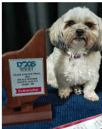
Novice Agility 200 Scrappiee JDX Jerline Chen