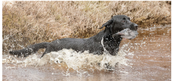
2ND PLACEGETTER ON 267 PNTS. R.T. CH BRIGODEE DIAMONDS BOW TY N TUX CM RUN BY KERRY WEBSTER