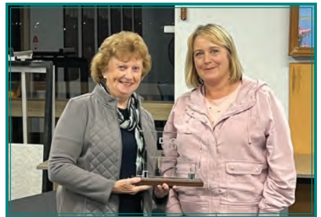
Conformation Top Dog 2022 - SUP CH SENNEN OOPS I DID IT AGAIN, Bernese Mountain Dog