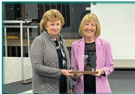
Obedience Top Dog 2022 - O CH NOBLESTARZZ CHASE THE ACE FSA HTMA, Border Collie