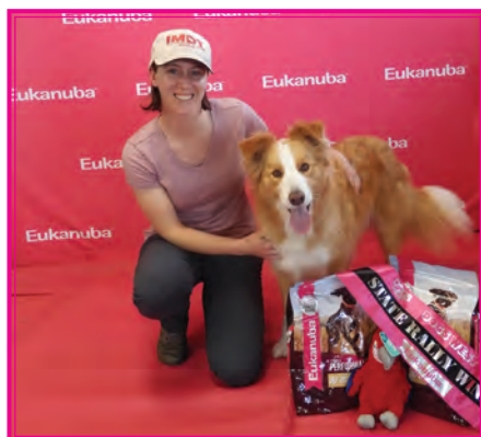
Rally Excellent JEZMIC BLUE NOSTALGIA SWN RA. TK.S. A Healey