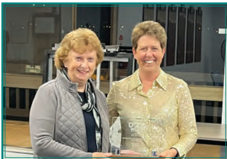
DWD Top Dog 2022 - CH UBIQUE DONT WALK AWAY RM TKN AD JDX FSA HTMA, Swedish Vallhund