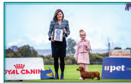
10- U13 Winner - Winter Rhodes