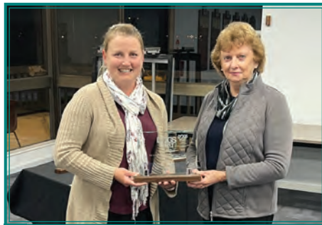
Agility Top Dog 2022 - AG CH 400 NETHERDEE REVVIN IT UP RN QND SD SPDX GDX, Cocker Spaniel