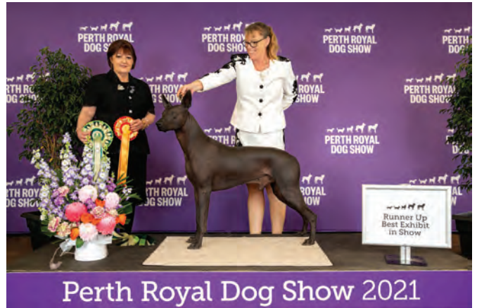
Perth Royal Dog Show 2021

BEST IN SHOW & STATE BRED IN SHOW - Ch Happybear Look Whos Talking (AI), Newfoundland, Miss N Ryan