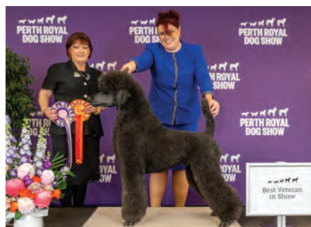
VETERAN - Sup Ch Aufait Fire Starter, Poodle (std), V Parke & H Turner