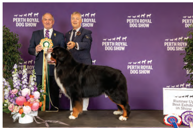
R/UP BEST IN SHOW & INTERMEDIATE IN SHOW - Ch Sennen Oops I Did It Again, Bernese Mountain Dog, R & K Berwick & D & G May