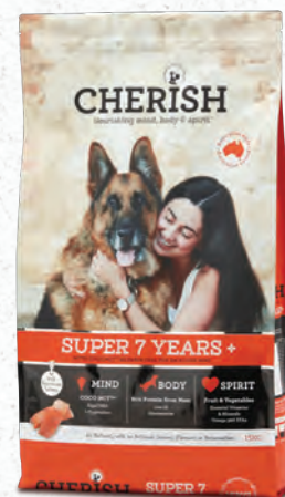
Super 7 Years+