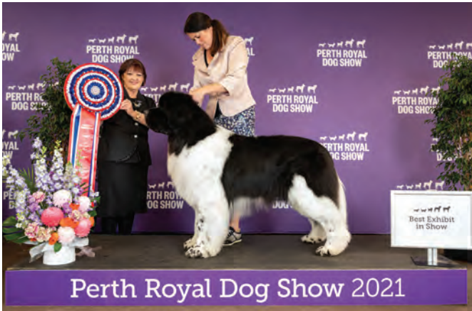
Perth Royal Dog Show 2021

BEST IN SHOW & STATE BRED IN SHOW - Ch Happybear Look Whos Talking (AI), Newfoundland, Miss N Ryan