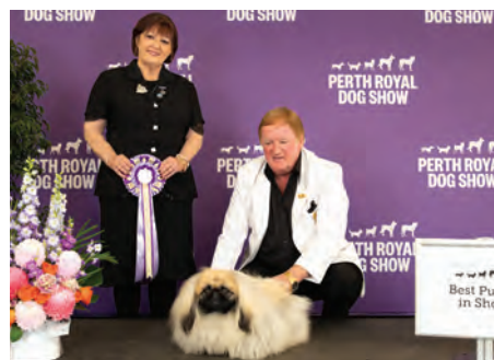
PUPPY IN SHOW - Athelow Raining Aces, Pekingese, Aristic Kennels